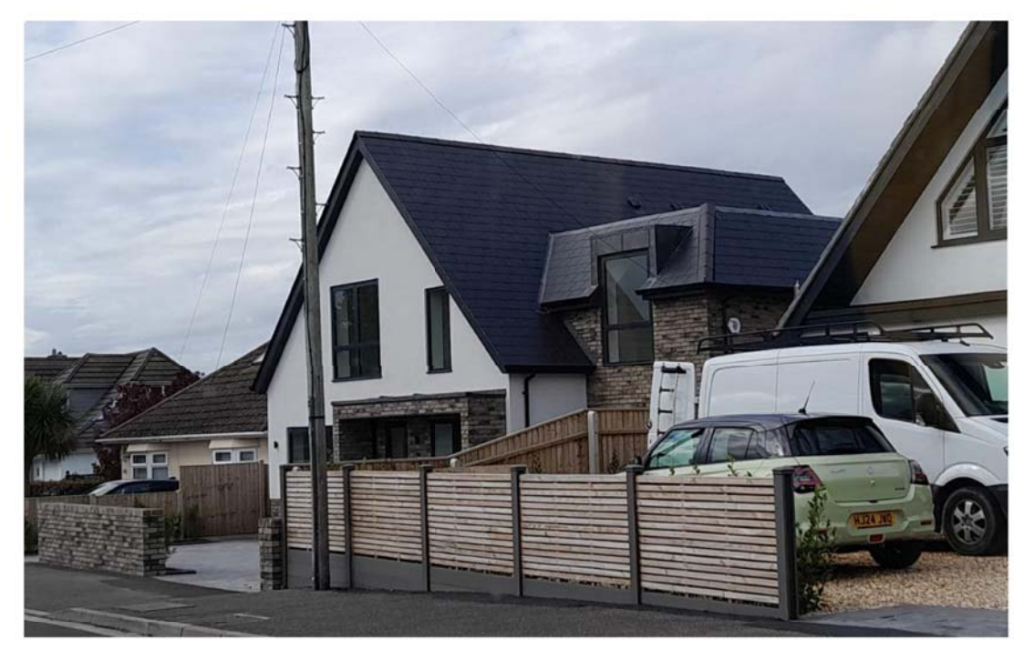
Nearby planning precedent: 12 Victoria Road -8/23/0088/FUL - Mansard / flat roof side extension (Dot Architecture Itd)