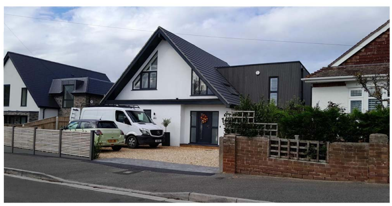
Nearby planning precedent: 14 Victoria Road - 8/21/0697/FUL -Flat roof side extension (Plans4home)